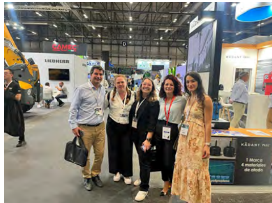
🇪🇺 Highlights from SRR with our member FER, and our partner Gremi de Recuperació de Catalunya!