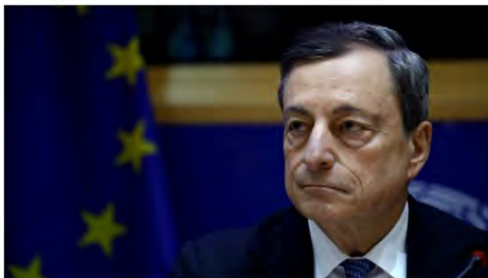
Former European Central Bank President Mario Draghi.